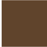
Bronze - BRZ