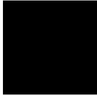
Black - BLK